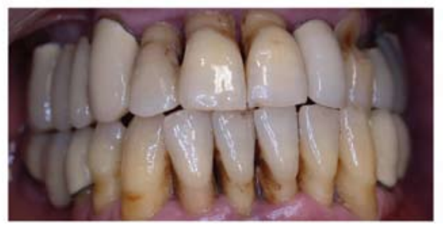
Fig. 2. Dentinal exposure (location of the lesion) secondary to periodontal tissue loss