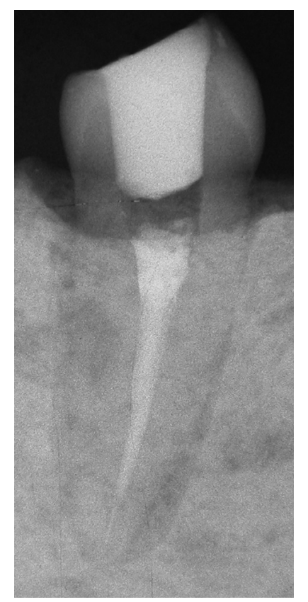
Fig. 1. Evaluation of the tooth # 205 (premolar; 1 canal; manual instrumentation). Length = 0; Density = 0; Taper = 0 \rightarrow \text{Overall} score = 0.